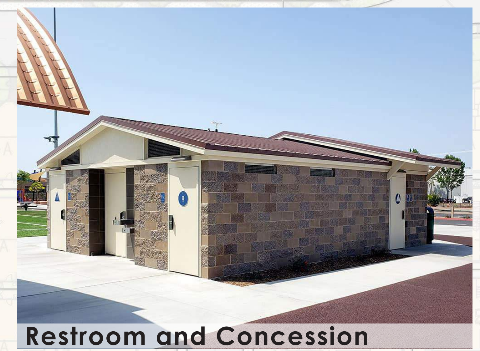
Restroom and Concession